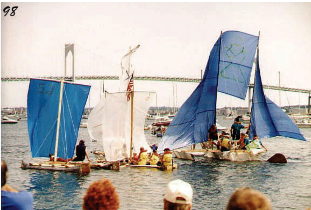
1998 Tight Racing at the Fools Rules Regatta!