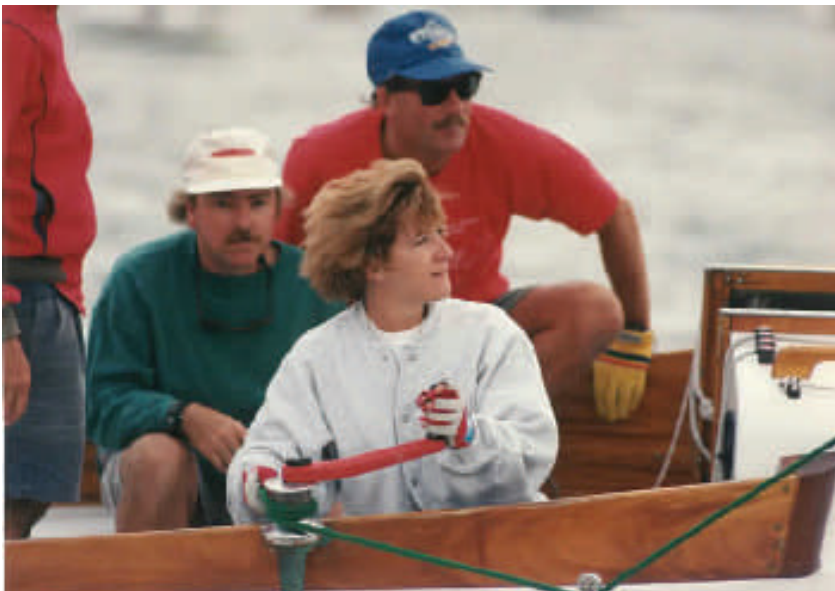
JYC Race night 1977