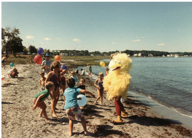
JYC Family Day August 1987

JYC Burgee Pins Available at Potluck Supper $5